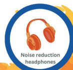
Noise reduction headphones