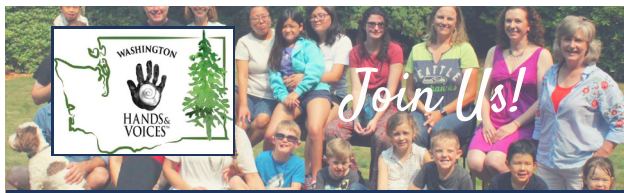
Washington Hands & Voices