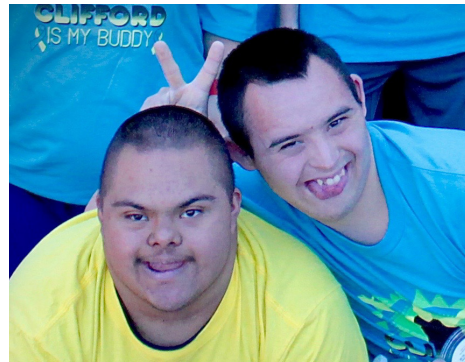
Fun & Friends!