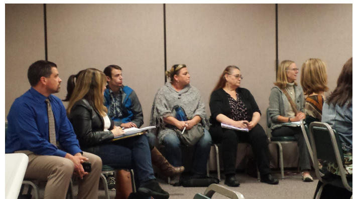
Parents and providers met with special and early education representatives from Bellingham, Blaine, Ferndale, Lynden, Meridian, and Mount Baker School Districts at the Infants and Children's Council meeting on September 29th.