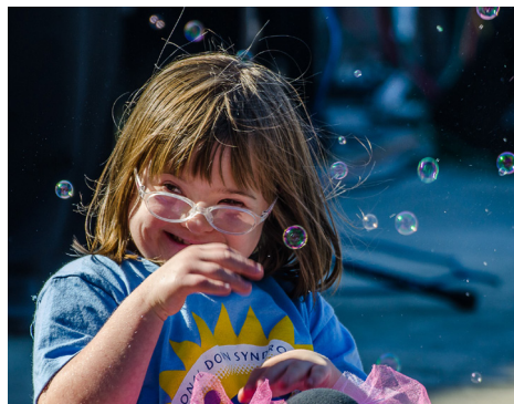
Who doesn't love bubbles?