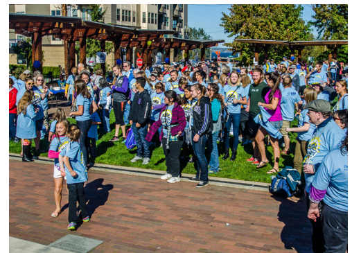
Fairhaven Village Green was full of happy faces!