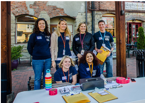
WECU's Sweat Equity Team volunteered for set up and registration. Thanks, WECU!