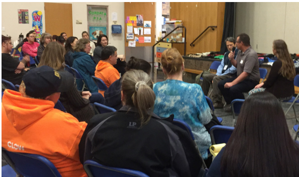
Parents and special education administrators at the School & Family Networking Night on October 12th

Advocacy means to support or speak on behalf of someone or something. School or education advocacy is supporting a student by speaking up and taking action to make sure they get all the services and supports they need.