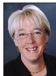
U.S. Senator Patty Murray (D) murray.senate.gov Phone: (425) 259-6515 Fax: (202) 224-0238

2930 Wetmore Avenue, Suite 903 Everett, WA 98201 Phone: (425) 259-6515