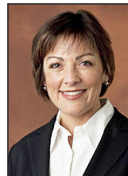
U.S. Representative Suzan Delbene (D) delbene.house.gov Phone: (360) 416-7879 Fax: (202) 226-1606

Canyon Park Business Center 22121 17th Ave SE Building E, Suite 220 Bothell, WA 98021 Phone: (206) 361-0233