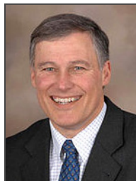
Governor Jay Inslee (D) PO Box 40002 Olympia, WA 98504 Phone: (360) 902-4111 Fax: (360) 753-4110 info@ofm.wa.gov

To reach the Legislative Hotline in Olympia, call 1-800-562-6000.