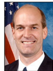
U.S. Representative Rick Larsen (D) larsen.house.gov Phone: (360) 733-4500 Fax: (202) 225-4420

119 N. Commercial Street Suite 1350 Bellingham, WA 98225 Phone: (360) 733-4500