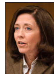
U.S. Senator Maria Cantwell (D) cantwell.senate.gov Phone: (425) 303-0114 Fax: (202) 228-0514

2930 Wetmore Avenue, Suite 9B Everett, WA 98201 Phone: (425) 303-0114